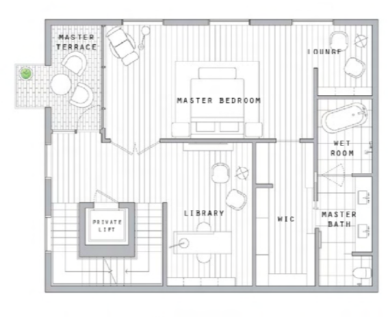
master bedroom level